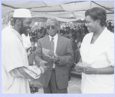
New mutuelle members receiving their membership cards

To make it easier for community members who lack financial resources to join mutuelles , PRIME helped facilitate short-term microcredit loans from rural banks in Bungwe and some of the other participating communities. In addition, PRIME assisted in revamping the organizational structure of the mutuelles and conducting training workshops on administrative and financial management for 216 people involved in daily management. PRIME's work with the mutuelles complements its other activities